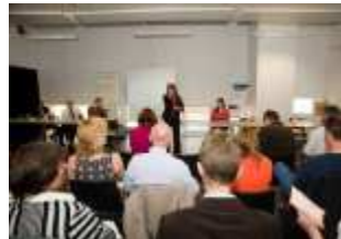
Delegates in the Cornerston Arts Centre, Didcot

'MMfCC' visited Didcot and Witney during May. As well as examples of low carbon solutions, two of